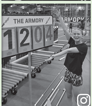
For more #HerkPride, follow us on Facebook. Twitter and Instagram @herkimercsd