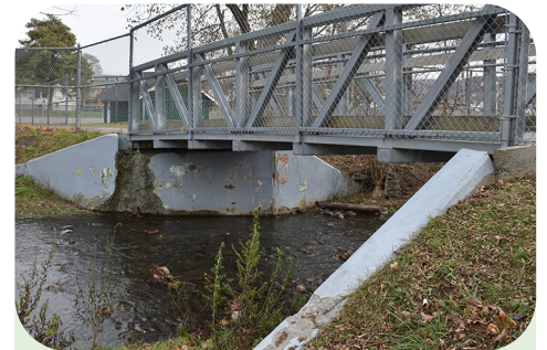
This bridge by the Jr./Sr. High School would be repaired to improve secondary entrance/exit.