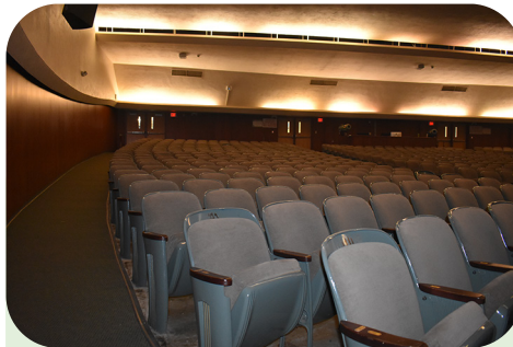
The auditorium and its entry area would be renovated and upgraded.