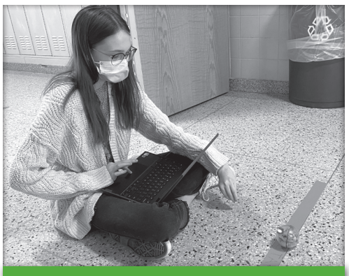
Technology and instruction go hand-in-hand at Herkimer. Grade 8 science students have been using robots to learn about Newton's Third Law.

The budget proposal also includes about $1.1 million for the first year of a five-year contract with Birnie Bus to continue providing transportation services, and a $100,000 capital outlay project for cameras, computer infrastructure, and control work (e.g. thermostats) at the elementary school. The bid submitted by Birnie Bus was $1.25 million less than the next bidder.