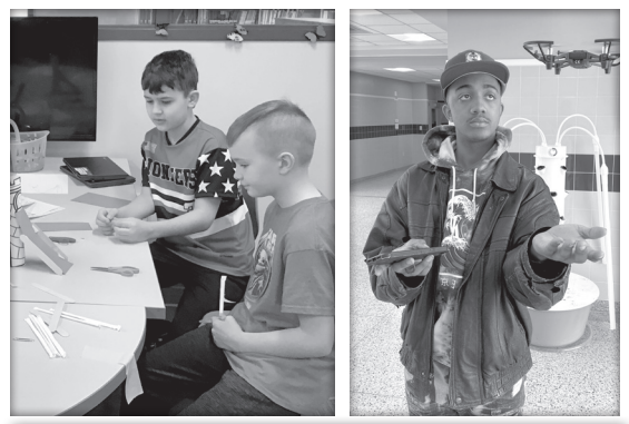
Left: Elementary students work on an engineering project in the library. Right: A student in the Drones 2 class at Herkimer Jr./Sr. flies a drone in the hallway. Students in the class are working towards becoming certified drone pilots.

The proposed budget contains funding for a $100,000 capital outlay project