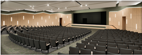
The Middle-High School Auditorium is undergoing a complete renovation. The rendering above shows what the new space will look like. Upgrades are also planned for the nearby chorus and band rooms, dressing room behind the stage and concession area.

The district is now proposing the establishment of a new 2026 capital reserve to help fund future capital improvements. The Board of Education would determine the annual funding for this reserve, which would come from unallocated fund balances and other available reserves.