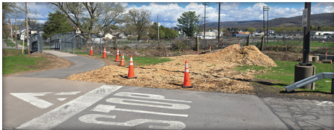
A much-needed vehicular bridge will be added to provide secondary emergency and bus access to the Middle-High School campus for the first time. The new bridge will also include a sidewalk for pedestrians.