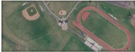
Scheduled improvements at the Athletic Complex include adding new energy-efficient field lighting, resurfacing the track, reconstructing the field event areas, making concession/press box updates and replacing the scoreboards, sound system and baseball dugouts.