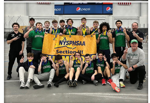
Above, top: Elementary Student Council members and advisors pose with a New York State School Boards Association Champions of Change award they received for the Socktober initiative. Above, bottom: The Herkimer boys indoor track team celebrates winning back-to-back sectional championships.

VOTE May 19, 2026 | Noon-8 p.m. Middle-High School Library Media Center