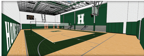
The auxiliary gymnasium at the Middle-High School will be renovated to allow for spectator seating, as seen in the rendering shown above.

What happens if the proposed 2026-27 budget is voted down? If the proposed budget is defeated on May 19, the Board of Education can put the same or a revised budget up for a vote in June, or it can immediately adopt a contingent budget. After two unsuccessful budget votes, Herkimer would have to adopt a contingent budget. State law mandates that under a contingent budget, a school district must adopt a budget with no tax levy increase and eliminate all non-contingent expenses, such as certain student supplies, certain equipment purchases and community use of school facilities that results in a district expense. The district would also need to make budgetary cuts to decrease spending.