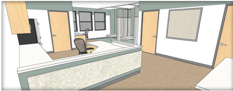
The Elementary Nurse’s Office will be relocated to a larger area and will include two bathrooms. Other elementary highlights include replacing the aging roof, cafeteria sound system and original bathrooms, upgrading heating and ventilation, adding air conditioning and reconfiguring other office and support spaces.