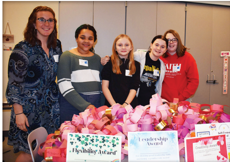
The Herkimer Elementary School Respect Club presents at a regional School Boards Institute showcase at Herkimer BOCES.

Facing rising operational expenses, the Herkimer Central School District has put forward a 2026-27 budget proposal designed to safeguard essential programs and staff while minimizing the burden on local taxpayers.