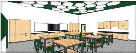
The former pool area will be used for classrooms and program expansions for our STEAM (science, technology, engineering, arts and math) programs. Above: a STEAM classroom rendering.